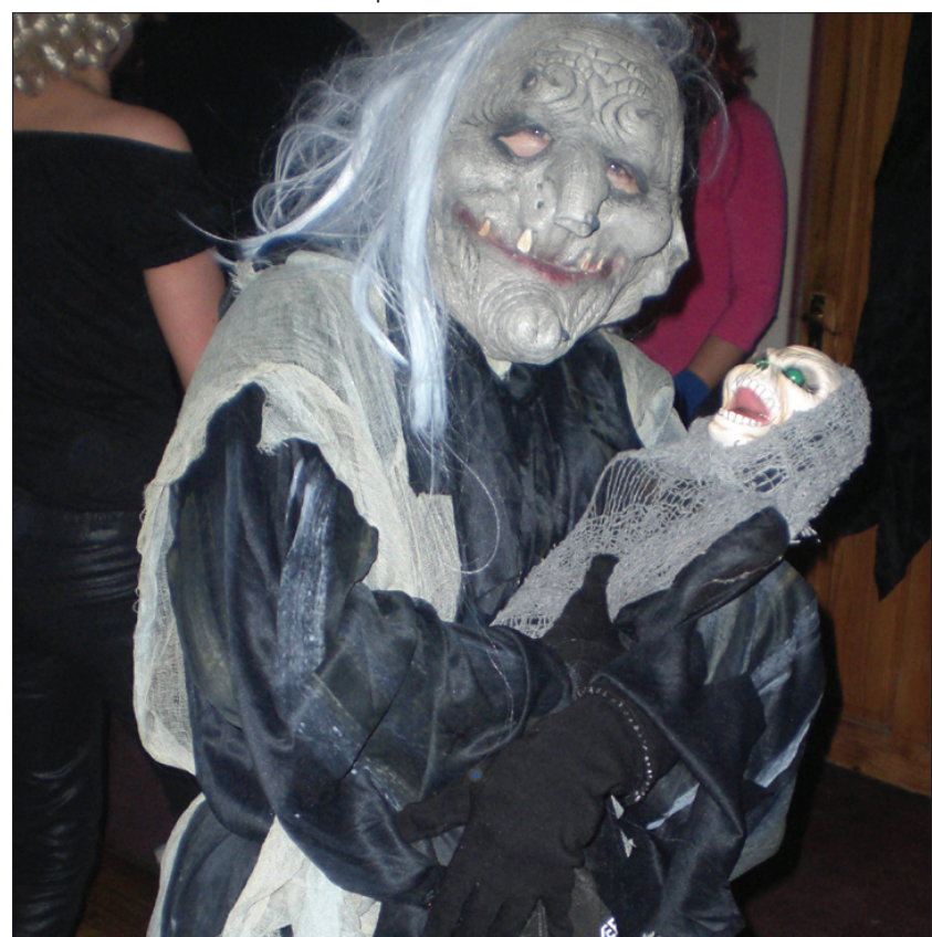
Getting into the Hallowe'en spirit in Dunne's, Clonegal.

Gach eolas ar imeachtaí Geilge ó Glór Cheatharlach Carlow Gateway Business Centre Bóthar Átha I, Ceatharlach (059) 9158105 / (085) 1340047 emma@glorcheatharlach.ie www.glorcheatharlach.ie